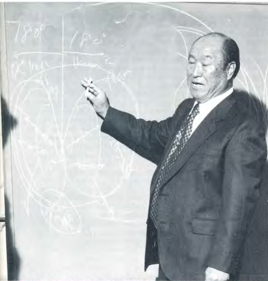
Father explains the one hundred eighty degree difference between heaven and hell.

God's plan was to disregard the Christian world and make a new foundation through me. God left the side of the Christians and came to stand on my side.