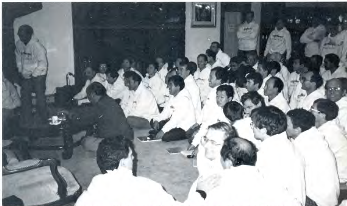
Father and the missionaries prepare to watch Mother give her speech on the satellite hook-up. He said, "I made a foundation on the worldwide level in seventy years. Mother will have the same foundation in seven months."

Soon I want to form an IOWC (International One World Crusade), sending two hundred professors and important people