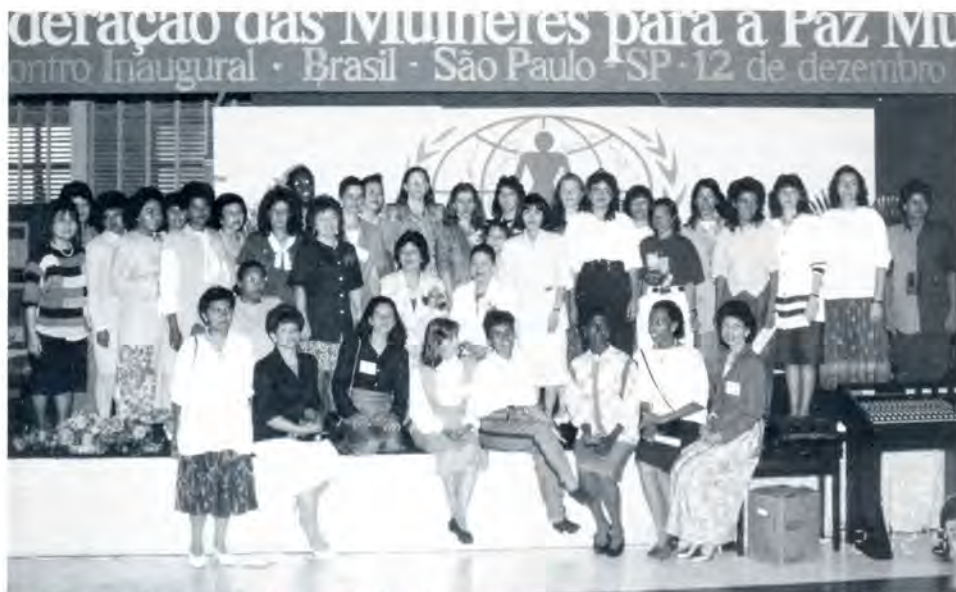
These are the sisters who worked so hard to prepare the meeting.

We thank Heavenly Father, in the name of all the WFWP sisters of Brazil, for waking many of us up and giving us this wonderful opportunity to work with Mother for this great cause. ■