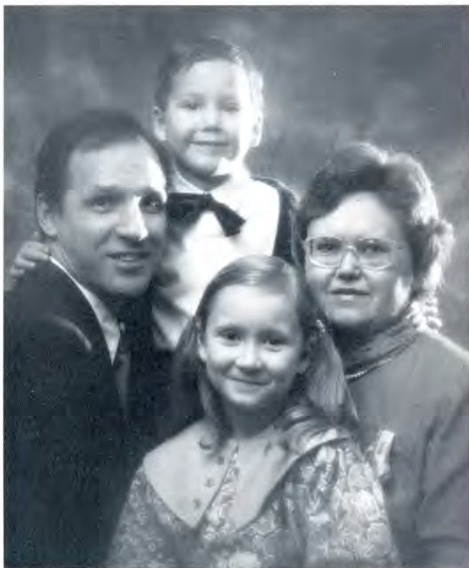
A Renz family portrait.

We must not be casual about the foundation we stand on. We must take the education of our children very seriously.