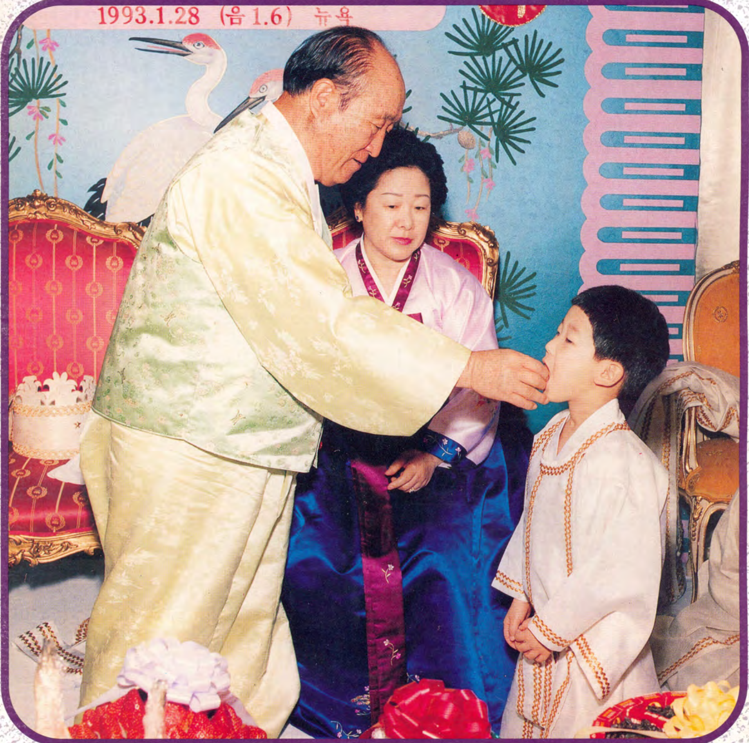
TRUE PARENTS' BIRTHDAY SPEECH KODIAK WORKSHOP SERIES