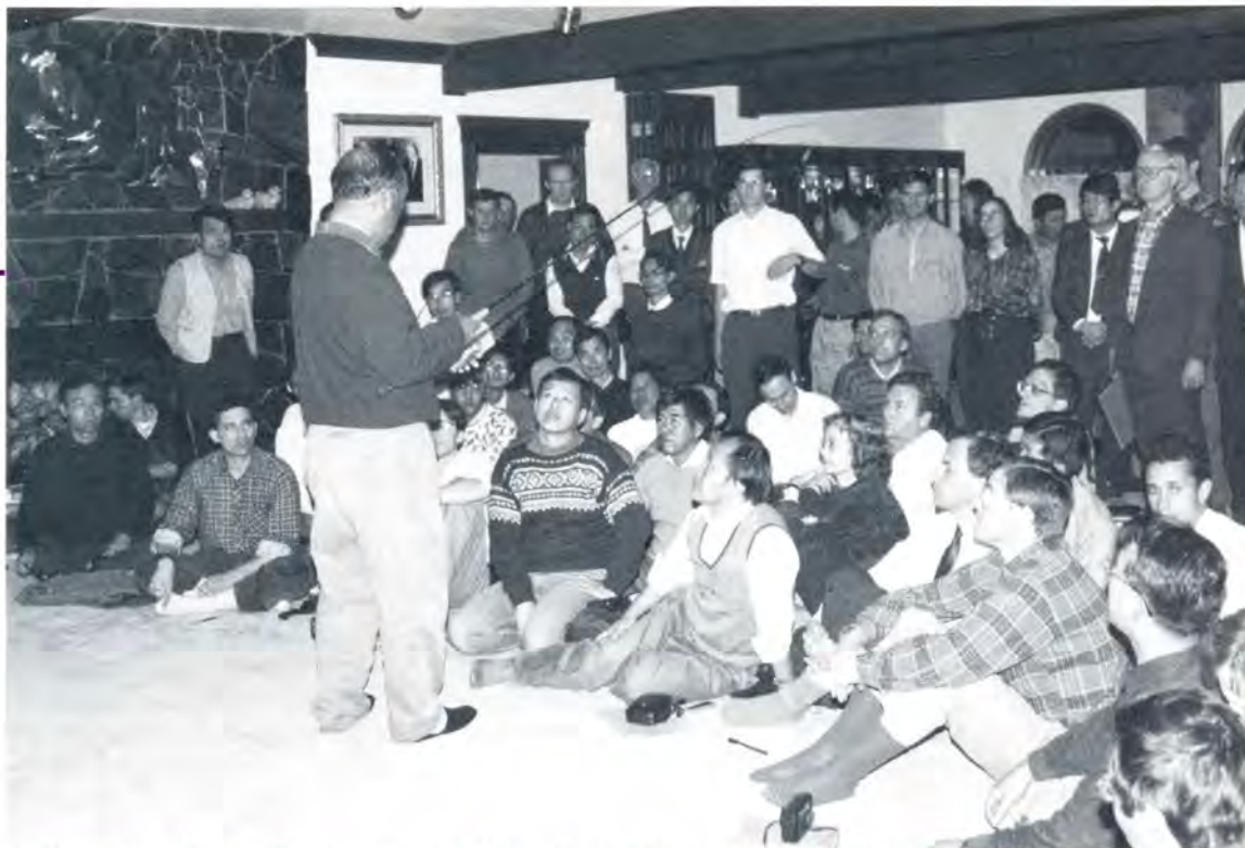
Father shows the brothers how to fish. He said, "In Africa set up a fish farm to solve the starvation problem. Starvation is more dangerous than war. Send people to Kodiak for forty days' training in fish farming."

The theme of my talk today was first love. Had there been no fall, you would all have experienced this first love. The whole cosmos would be concerned with your life. Heaven wants to connect to you based on the foundation of first true