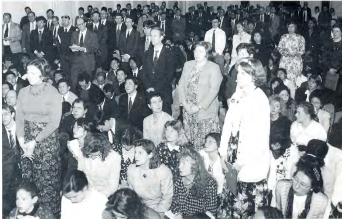
Father asks the Unification Theological Seminary graduates to stand. He called them to come to this particular celebration.

In 1975, I needed the elite members to send out all over the world for mission work. So many countries needed able members for mission work. However, I thought UTS was more important for the sake of the future. For that reason, I spared very important leaders out of those assigned to the mission field and sent them instead to UTS. Your position is very awesome and